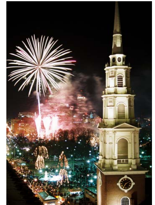
2006 First Night and The Park Street Church